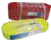
2-PLY Tow Straps