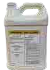
TANK CLEANER HWF100092

Handler II and III come with venturi and recirculation kit.