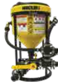
HANDLER I – 2" 15 imp gal NO VENTURI