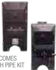
COMES WITH PIPE KIT