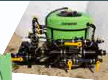
CHEMBINE MIXER 75 US GAL