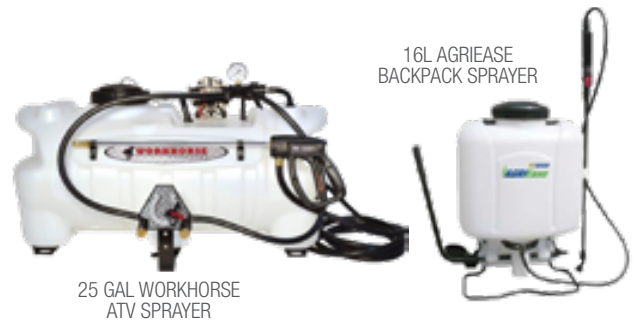
25 GAL WORKHORSE ATV SPRAYER